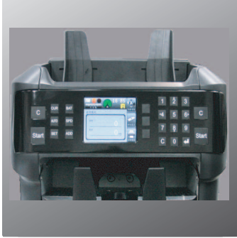
3.5 inch TFT color display with graphic user interface. Easy to view and browse.

X-1000 is the high-performance & heavy-duty currency discriminator with a dedicated reject pocket. It is equipped with the most comprehensive, user-interface and functions necessary for tellers and cashiers to improve cash management efficiency. With an ergonomic design and 3.5 inch TFT color display, the X-1000 not only provides tellers with clear visual of counting results, also allows uninterrupted counting with the dedicated reject pocket. In addition to its highest efficiency rating and superior user-experience, the X-1000 provides advanced security standards against the latest counterfeiting attempts through multi-detection technology while keeping low false alarm and highest recognition, thus increasing productivity.