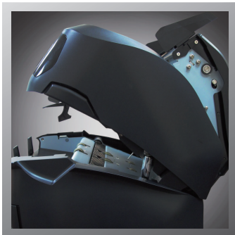
Compact design with reliable system detection and easy banknote jam removal.