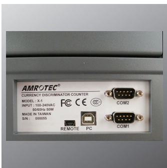
Various I/O ports for user-friendly SW upgrade, Printer and Remote display.